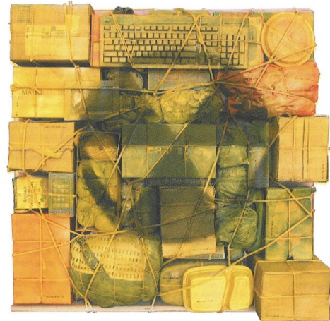
D.I.Y Fallout Shelter: Fear 40 (2011) Mixed Media 3'4"L X 3'4"W

In contrast, Fear 400,000 - Five Star Fallout Shelter - is an interpretation of anxiety in today's complex society. It satirizes the hierarchy of safety that the wealthy could buy more safety in situations of crisis. Similar to the penthouse of a luxury high-rise that offer wider views, larger floor area, and better services, deeper shelter in the ground will provide a higher PF index, more uncontaminated water, air, and better amenities, as well as longer survival. This would show a bitter truth of the biggest contemporary crisis; the collapse of humanity.